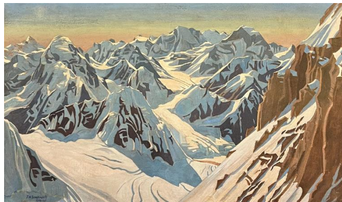
Looking from the North Col of Everest